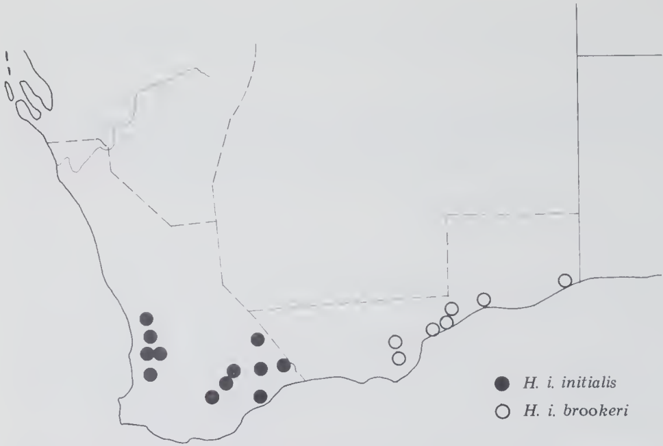
Fig. 1. Map of southern Western Australia showing location of specimens of Hemiergis i. initialis and H. i. brookeri .